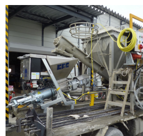
MAI®400NT with automated feeding