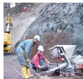
Injection of self-drilling anchors